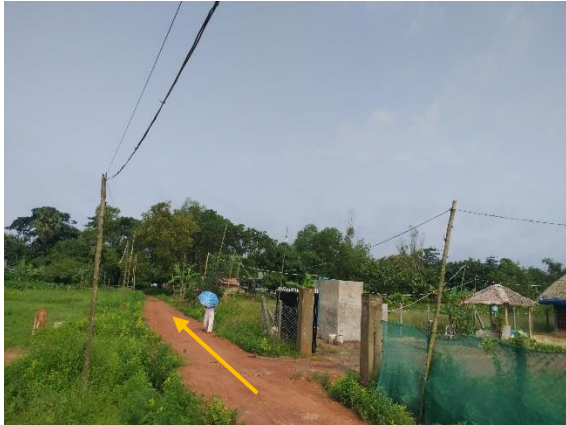
Road to the village