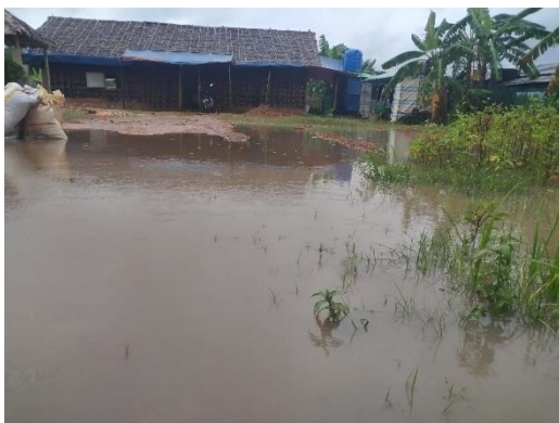
Rain flood at compound