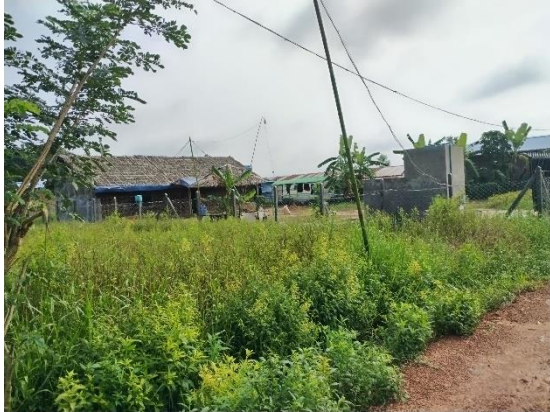
Our home from front view